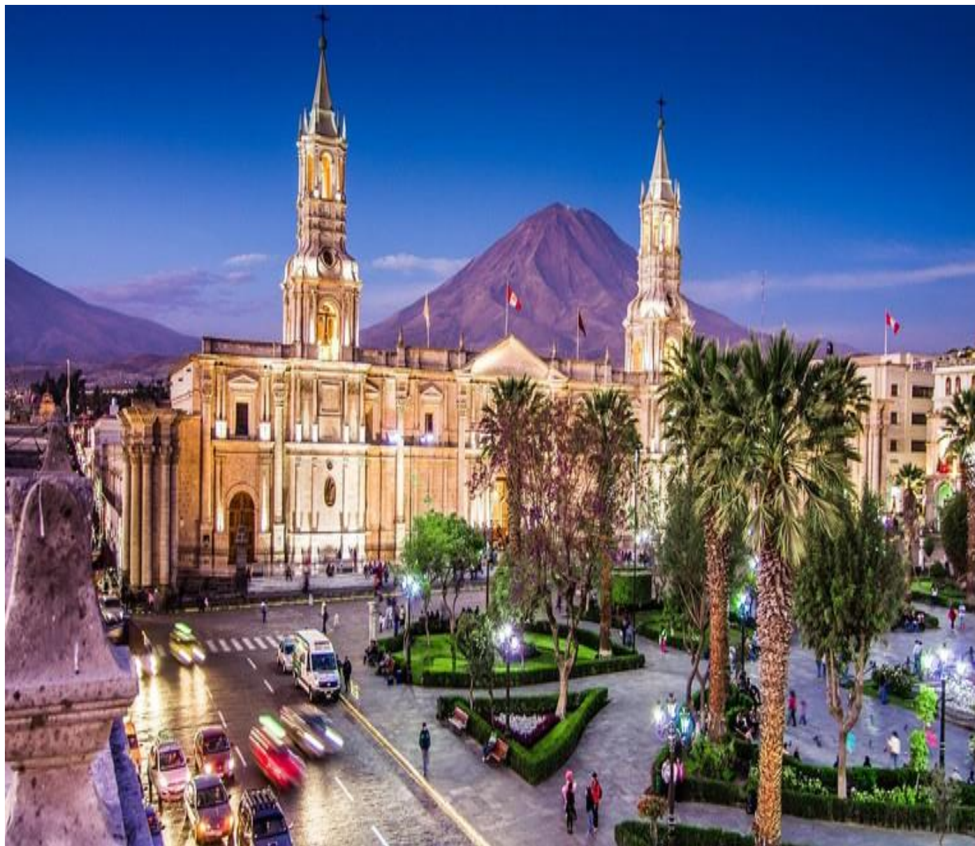
City of Arequipa