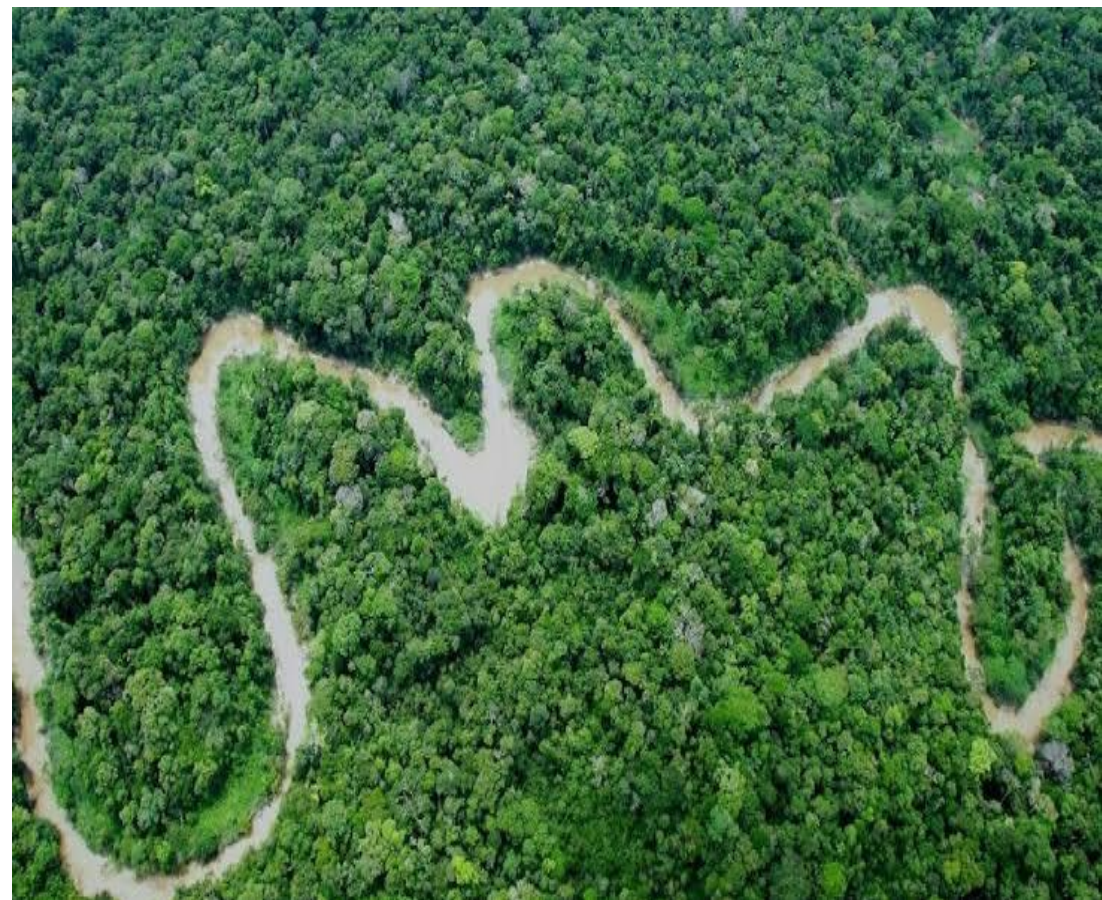
Amazon Rainforest in Peru