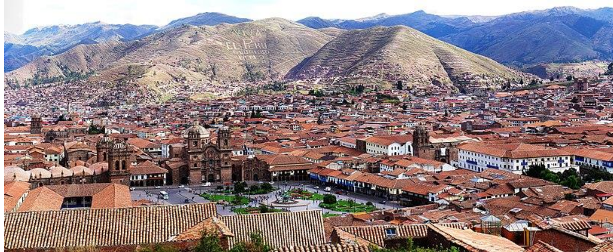
City of Cusco