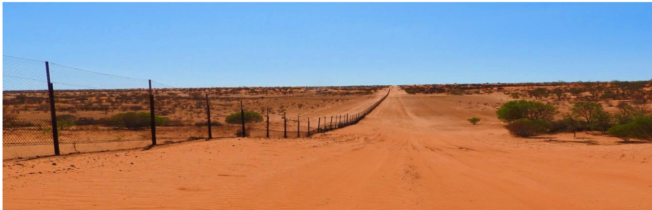
Dog Fence- 5614 Kilometres long

This is not included in the price of the tour. .Your seamless adventure awaits!