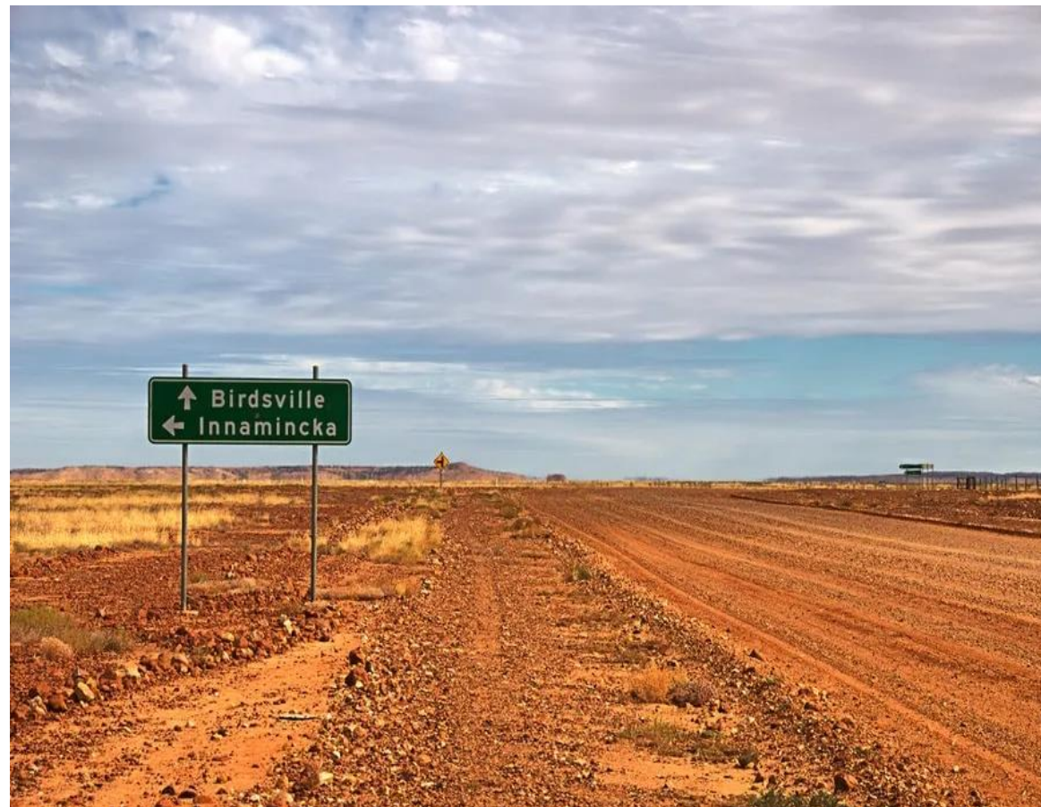
Road to Birdsville

To ensure a peaceful journey for all, we recommend booking a single room if you're a light sleeper, traveling alone, or prone to snoring. There are only seven single rooms available, after which passengers will be placed in twin rooms. Your comfort is our priority.