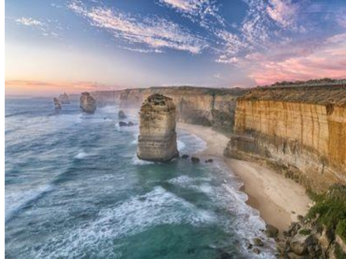
12 Apostles – Great Ocean Road